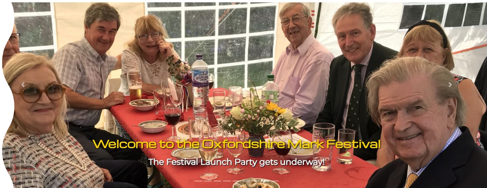
Welcome to the Oxfordshire Mark Festival The Festival Launch Party gets underway!